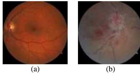
Figures 2. Eye Fundus Images (a) Normal Eye Image, and (b) Diabetic Retinopathy Image

The normal eye structure has perfect retinal vasculature and small blood vessels consisting of the retina, fovea, macula, posterior pole and blind spot or optic disc. Whereas in diabetic retinopathy images there is damage to the small blood vessels of the eye, namely the presence of microaneurysm which occurs because the smallest wall of the vessel is weakened. The wounds on the vessel can cause exudates, which are yellowish dots in the retina area.